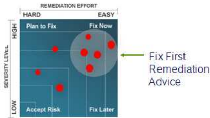
Veracode's Fix First Analysis quickly identifies flaws to reduce the time & effort associated with HIPAA compliance