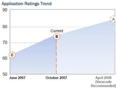
Veracode's On-Demand Service tracks your application's ratings over time, enabling you to create a plan of action with compliance project milestones