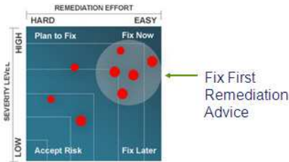
Veracode's Fix First Analysis quickly identifies flaws to reduce the time & effort associated with GLBA compliance