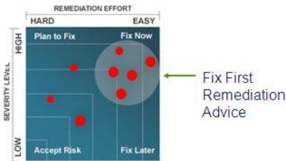
Veracode's Fix First Analysis quickly identifies flaws and guides your developers through remediation efforts