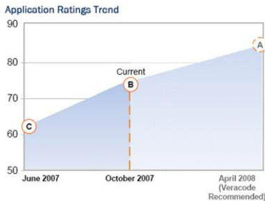
Veracode helps organizations track application ratings over time, enabling you to improve your project milestones